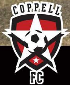
COPPELL FC 07 BOYS