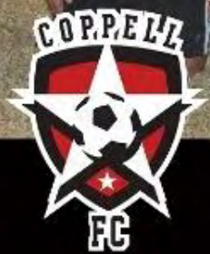
COPPELL FC 05 BOYS RED