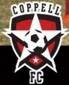
COPPELL FC 06 BOYS