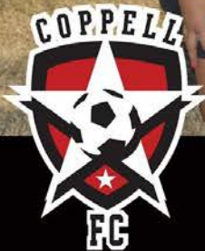
COPPELL FC 07 GIRLS