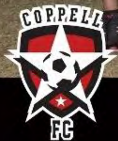
COPPELL FC 05 BOYS BLACK